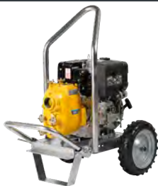
VAR 3-140 B TROLLEY - R