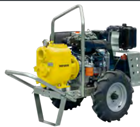
VAR 3-140 D TROLLEY - E