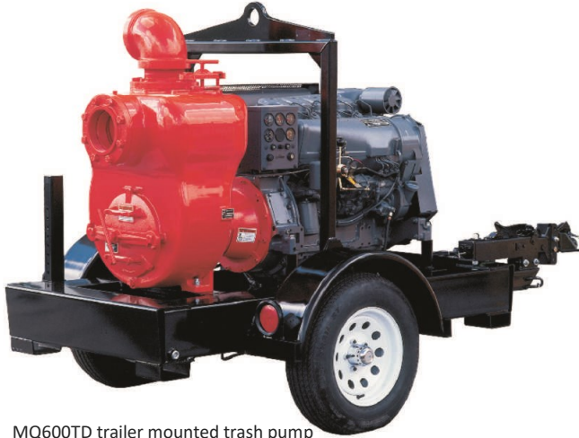
MQ600TD trailer mounted trash pump